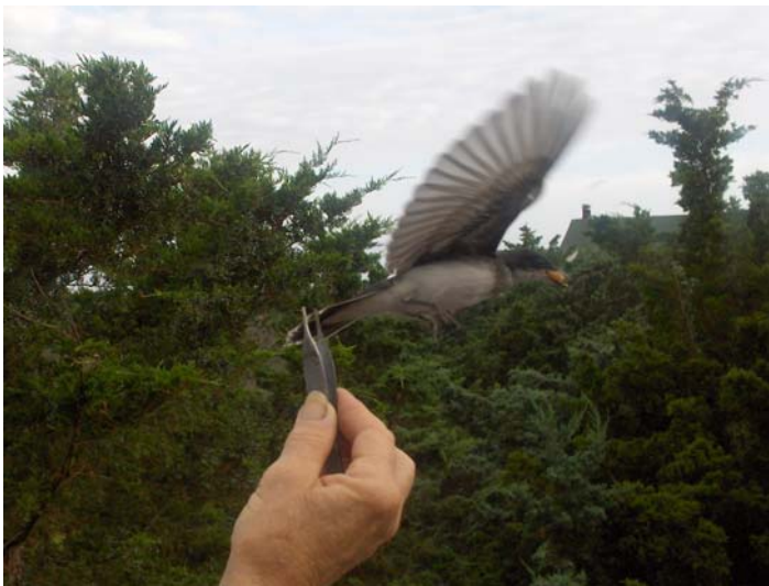
A released kingbird “captures” worms from rehabilitator.

Fruit hangs throughout the cage to attract fruit flies. This encourages the fledged birds to begin to hunt and capture fruit flies. It also improves their motor skills. The hole in the enclosure allows for “soft release;” juvenile birds can come and go as needed