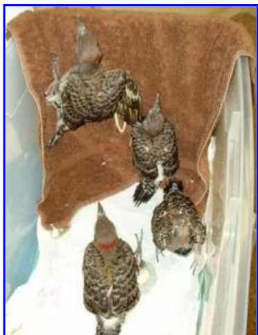
Juveniles: Juvenile flickers admitted to rehabilitation can present difficult behavior problems.