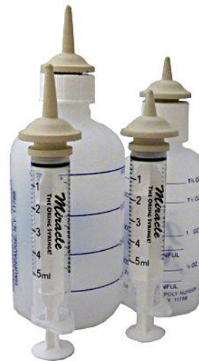
Miracle Nipple Excellent Choice