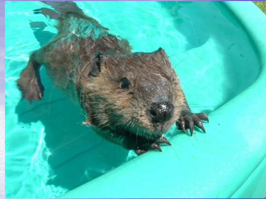
3 months old~10 pounds